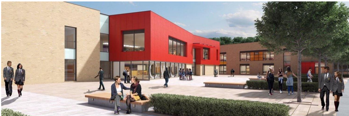
An artist's impression of our new Cardiff West Community High School in Trelai Park, opening Spring 2019

Established January 2018 To be reviewed January 2020